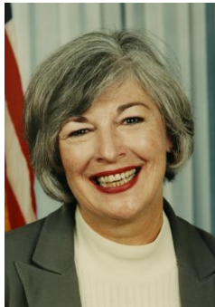
The Honorable Lynn Woolsey