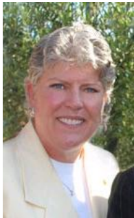
The Honorable Julia Brownley

Assemblywoman Julia Brownley was elected to the California State Assembly in November of 2006 and has been appointed to be the next Chair of the Assembly Committee on Education. She is also Chair of the Assembly Budget Subcommittee 2 on Education Finance, which reviews all K-12 and higher education budget matters, and Chair of the Assembly Select Committee on Higher Education in the 21st Century, which focuses on the UC and CSU systems, their budgets, and other long-range issues. Prior to being elected to the Assembly, she served for 12 years on the Santa Monica-Malibu Unified School District board – three times as Board President. She has a bachelor's degree in Political Science from George Washington University and an M.B.A. from American University.